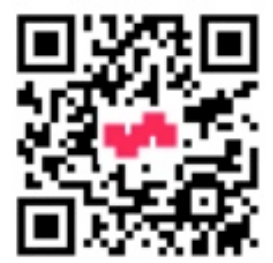
Fig. 2 QR-Code used as Business Card

Business card: QR Codes can be easily used for business cards. By simply storing all contact data in a .vcf file and putting it online, a hyperlink is created and coded via QR-Code. Afterwards with any mobile device the image can be decoded. By selecting the hyperlink all data is saved to the local address book. If the mobile device is synchronized with a Personal Computer or Laptop the contact is automatically stored in the usual address book. Only one scan and one click is necessary instead of collecting printed business cards.